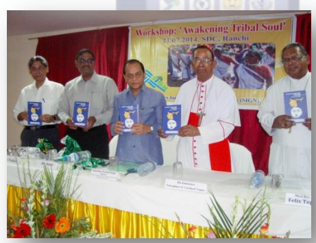
Dignitaries holding the book after launch