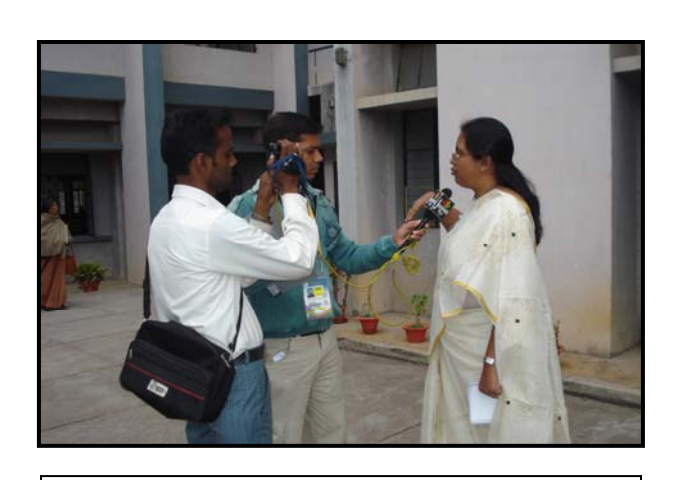
Representatives from press