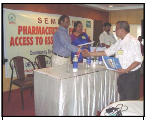
Distribution of STG to the participant doctors

The participants also suggested that CDMU should regularly publish rational drug bulletin and distribute to the medical officers of tea gardens. They also suggest that CDMU should circulate some of the WHO publication to them.